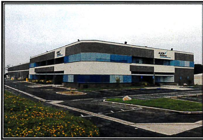
Align's logo proudly displayed on multiple sides of the building

We wanted to reach back out to you today to provide you with an update on how our plans were progressing and ensure our focus to have no disruptions to our service and operations during this process.